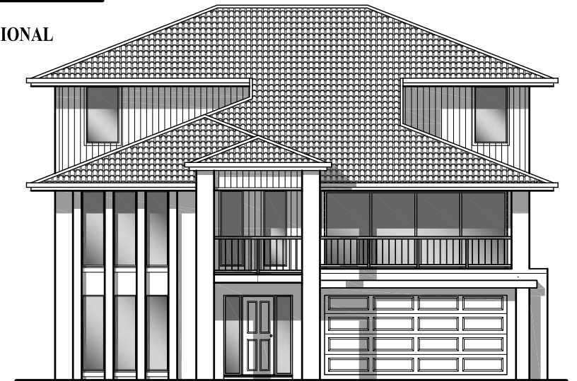
RESORT (OPTIONAL - $8,850)